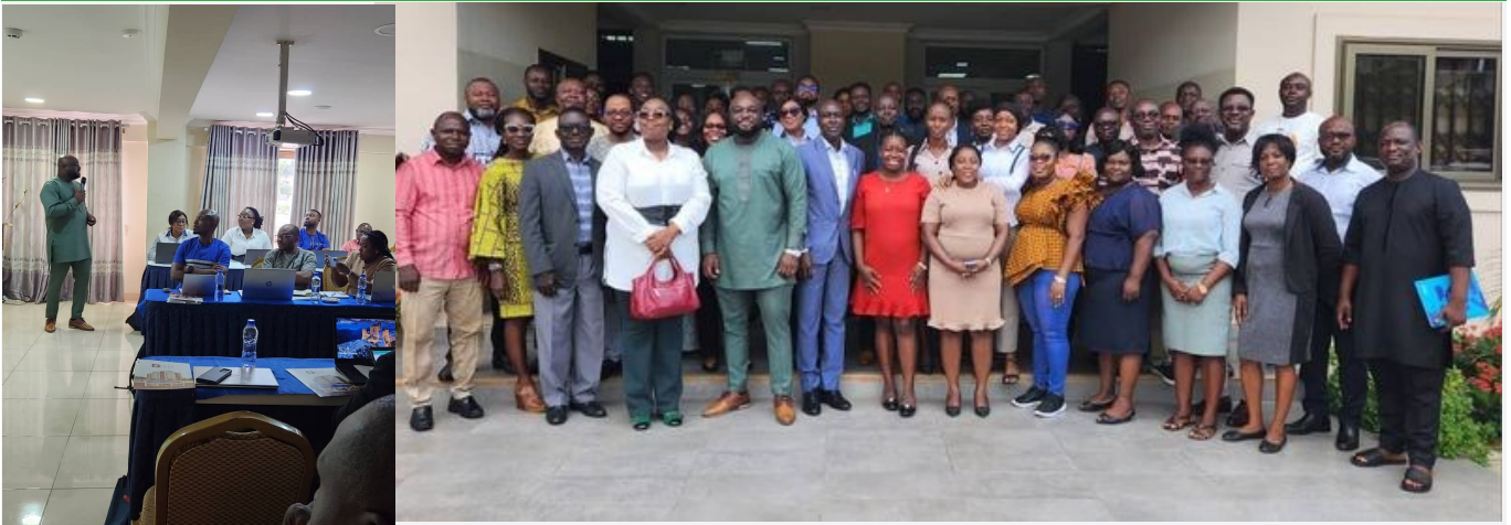
GHANEPS TRAINING FOR GHANA HEALTH SERVICE STAFF