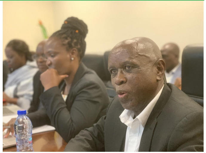
PPRA BOSTWANA VISITS GHANA