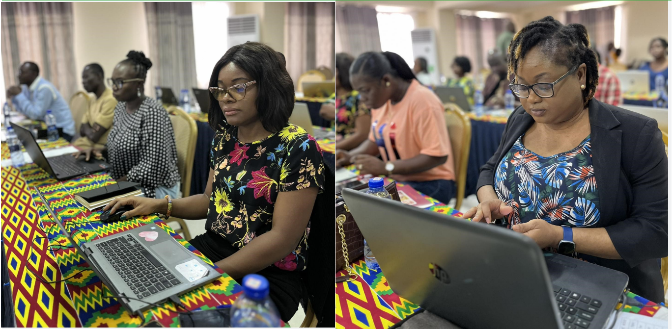
PPA MANAGEMENT AND STAFF RETREAT