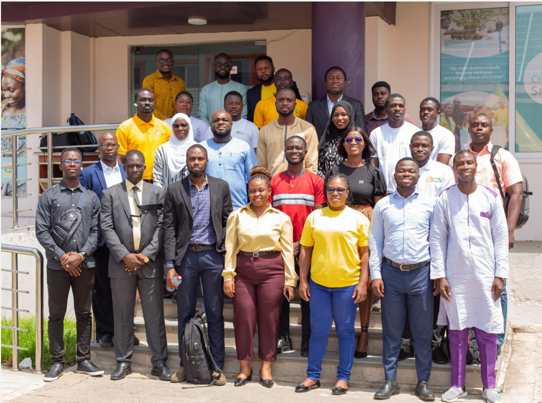
GAMBIA'S PUBLIC PROCUREMENT VISITS GHANA