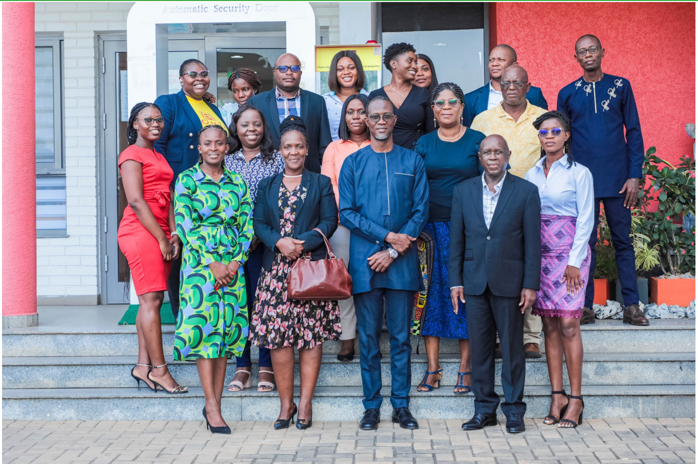
PPRA BOSTWANA VISITS GHANA