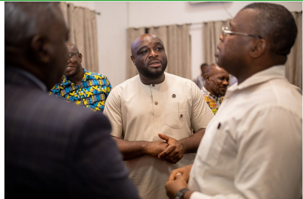
PRESENTATION ON GHANEPS DELIVERED BY DEP. CEO AT THE GHANA INSTITUTE OF ENGINEERING