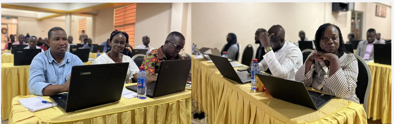
GHANEPS TRAINING IN SUYANI FOR PROCUREMENT OFFICERS