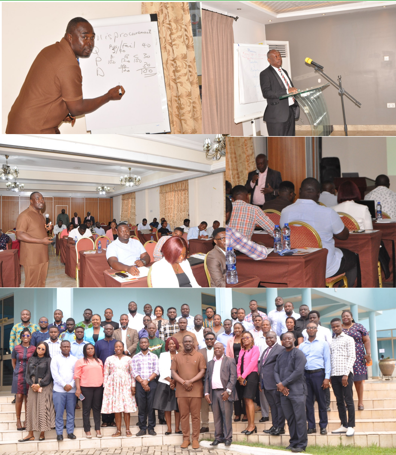
TRAINING ON THE NEWLY DEVELOPED SPECIALIZED PROCUREMENT AUDIT FRAMEWORK (SPAF)