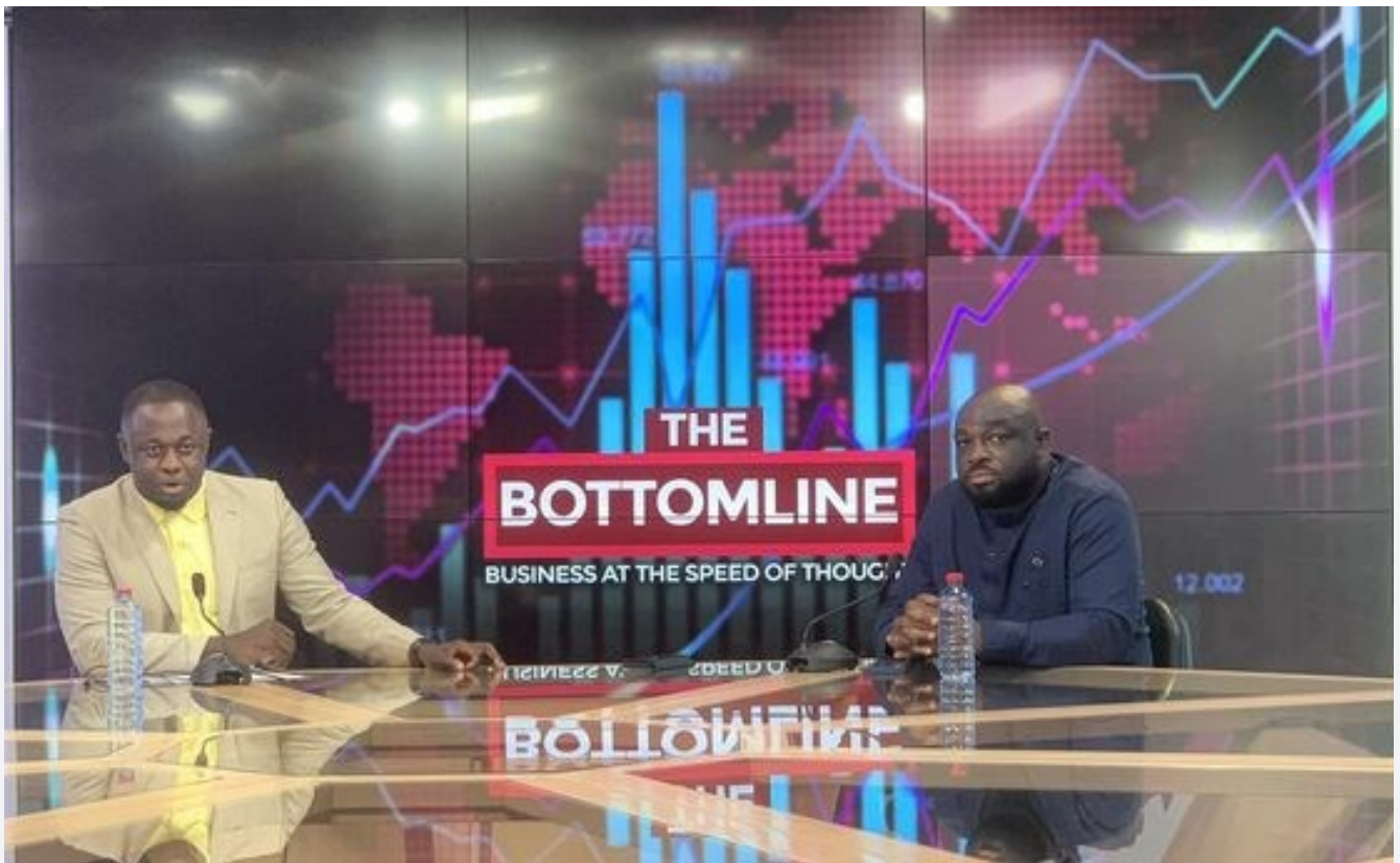
DEPUTY CEO OF PPA ON BOTTOMLINE ON METRO TV DISCUSSING CURBING PUBLIC SECTOR CORRUPTION THROUGH E-PROCUREMENT