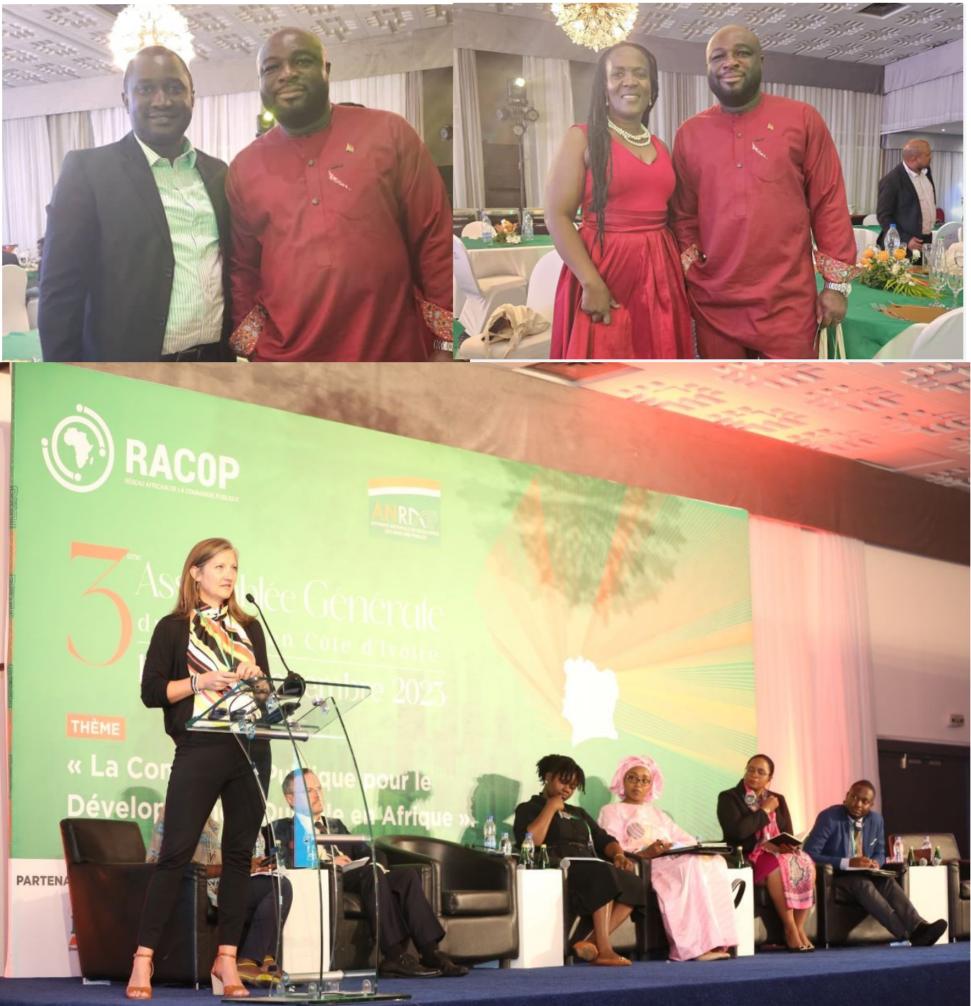
PPA AT THE AFRICAN PUBLIC PROCUREMENT NETWORK (APPN)