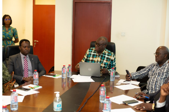
GAMBIA'S PUBLIC PROCUREMENT VISITS GHANA