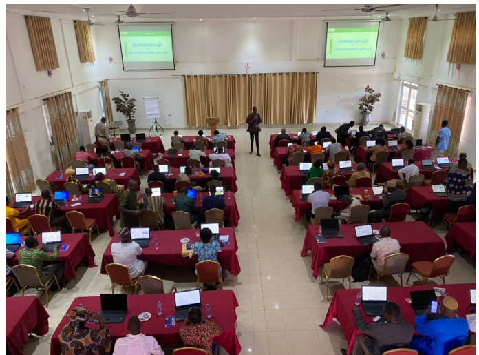
KICK-OFF SESSION/STAKEHOLDER ENGAGEMENT AT BAMBOI POLYCLINIC, SAVANNAH REGION