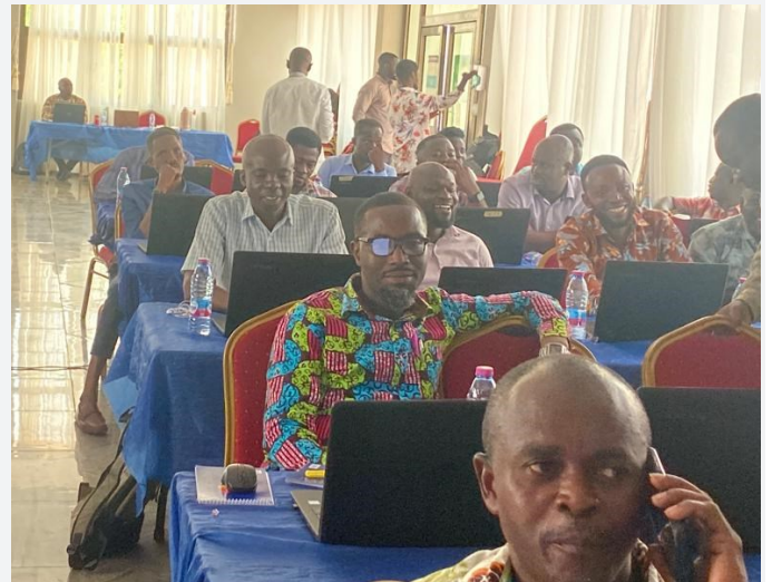
GHANEPS Training -Sefwi Wiawso