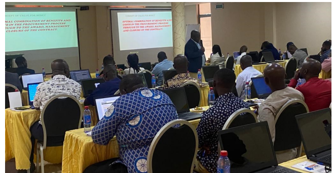
GHANEPS Training - Sunyani