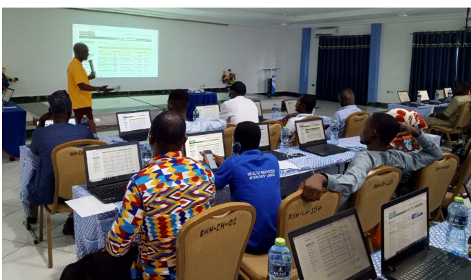
GHANEPS Training -Wa