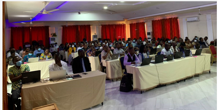
GHANEPS Training -Ho