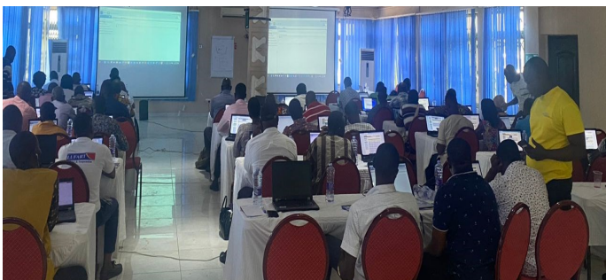
GHANEPS Training -Bolgatanga