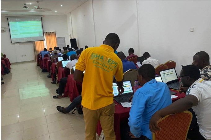
GHANEPS Training -Tamale