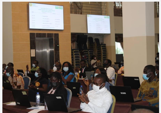
GHANEPS Training - Koforidua