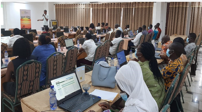
GHANEPS Training - Kumasi