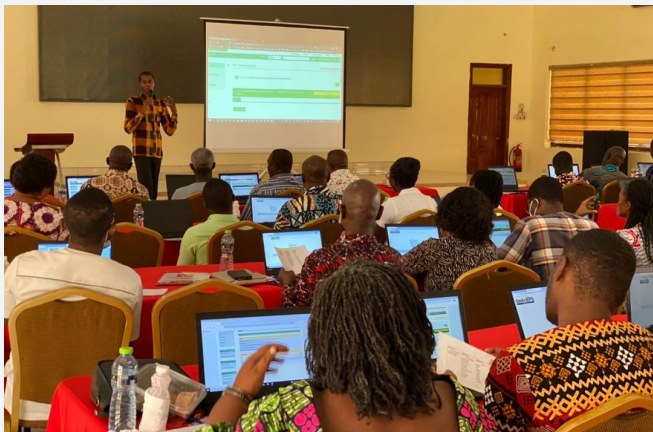
GHANEPS Training - Cape Coast