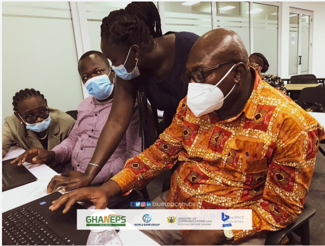
GHANEPS Training -Accra