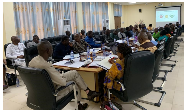
Session with Vice Chancellors Ghana– Cape Coast