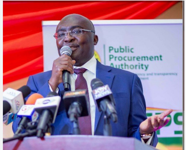
Photos from GHANEPS launch