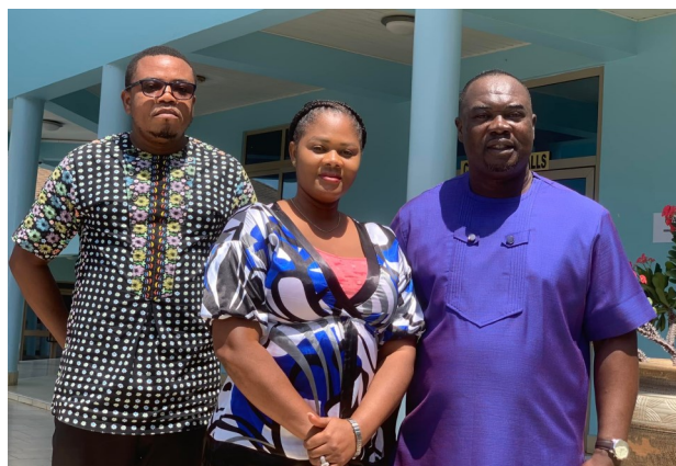
CAPACITY BUILDING TRAINING ORGANIZED BY PPA