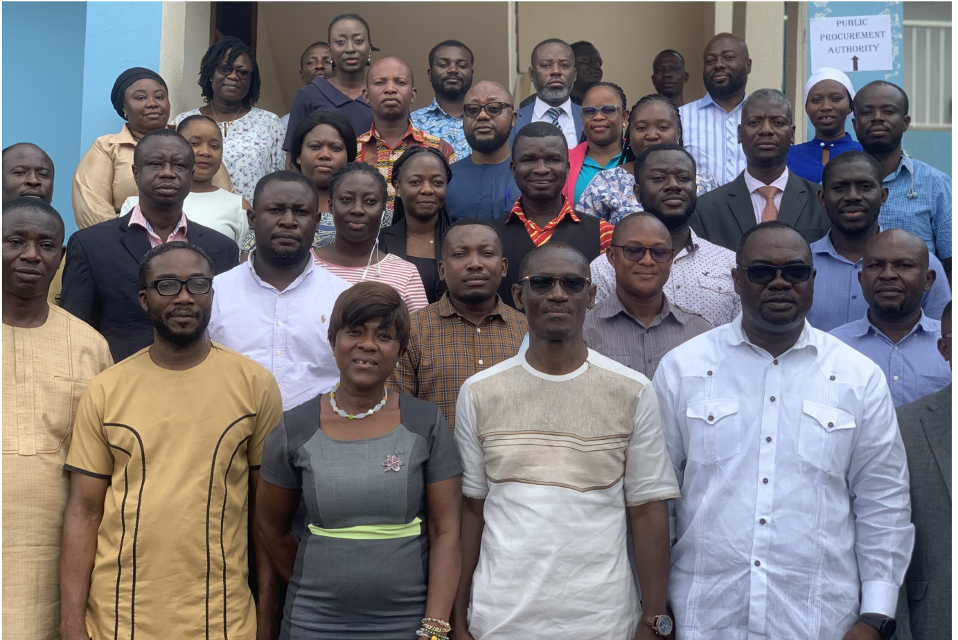
CAPACITY BUILDING TRAININGS ORGANIZED BY PPA