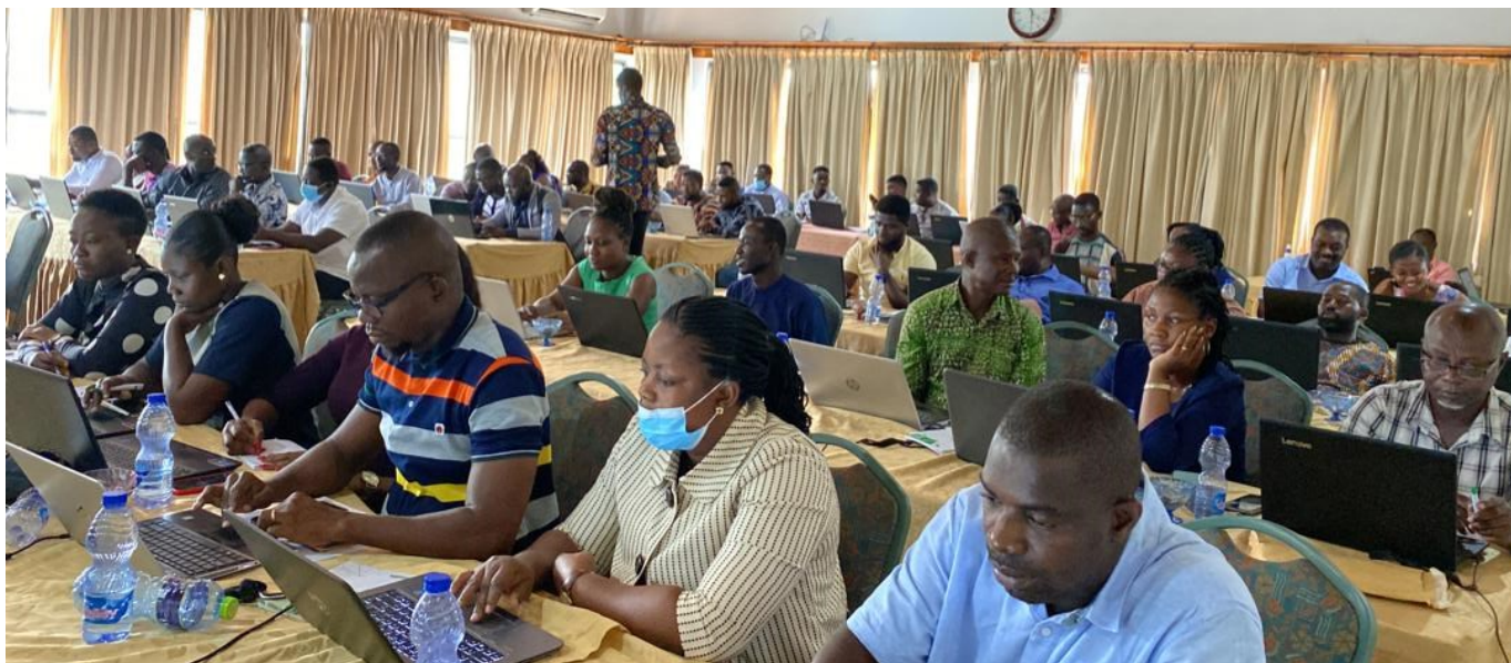
GHANEPS TRAINING IN KUMASI