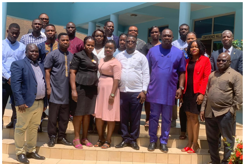
CAPACITY BUILDING TRAINING ORGANIZED BY PPA