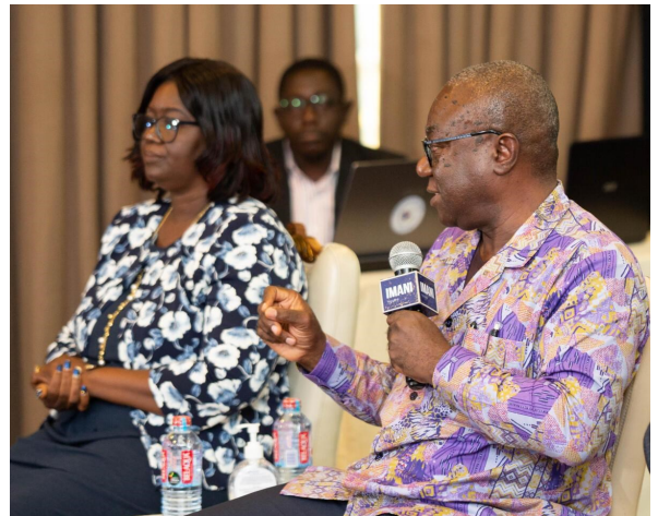
PPA AT THE PUBLIC PROCUREMENT REFORMS FORUM ORGANIZED BY IMANI AND ACEP