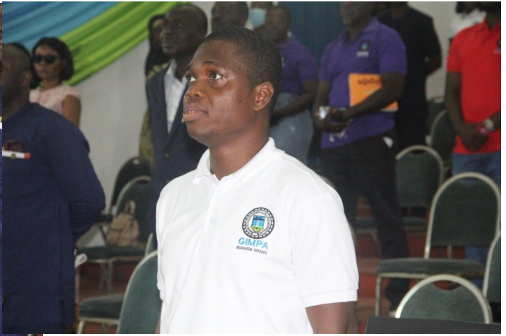
CEO OF PPA LECTURES AT GIMPA