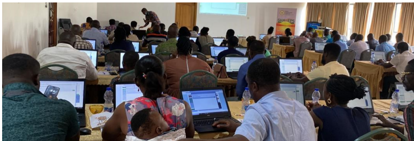
GHANEPS TRAINING IN KUMASI