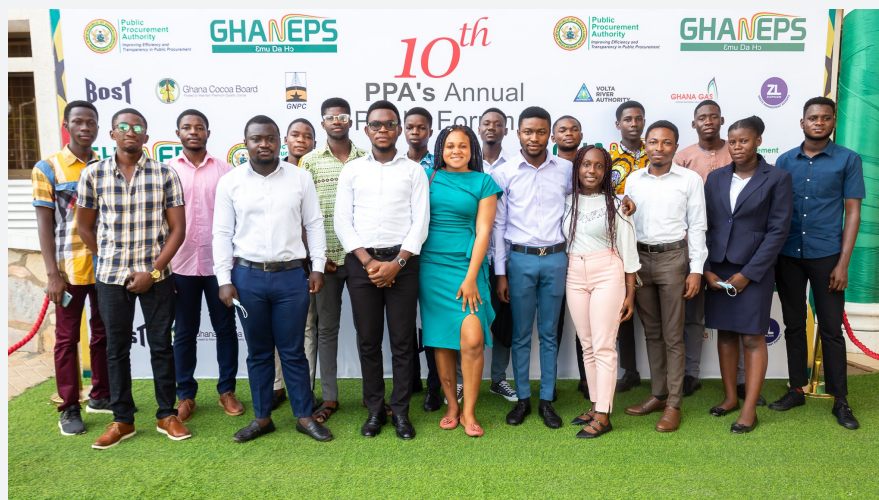
Students - University of Professional Studies (UPSA)