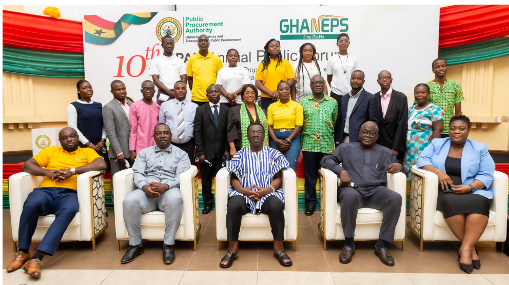
Board Members, Management and Staff of PPA