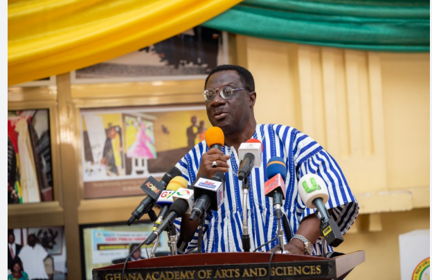
Board chairman of PPA and the former Minister of Education ,Prof. Ameyaw-Akumfi