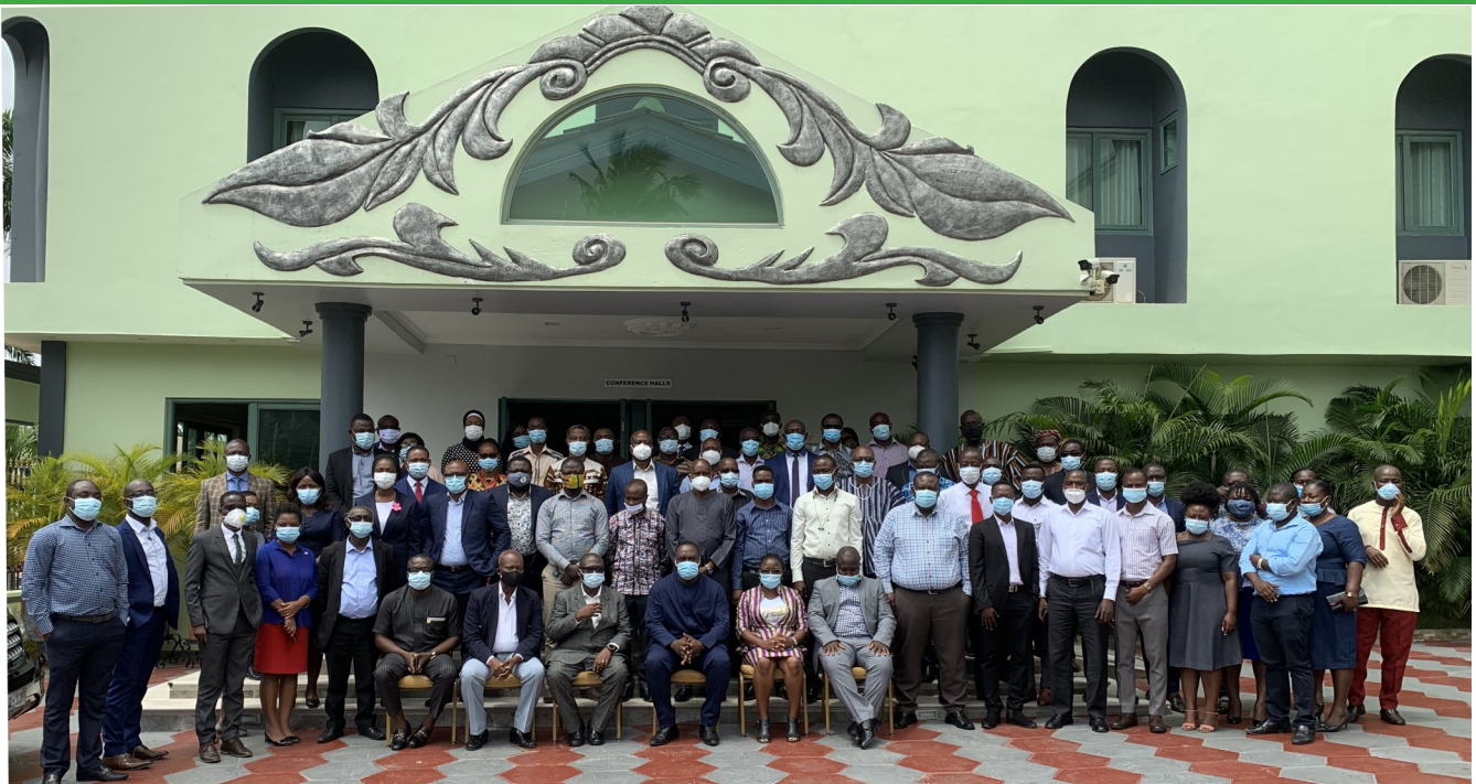
AG, CEO OF PPA, TRAINERS AND PARTICIPANTS

The Public Procurement Authority (PPA) has organized six (6) training workshops on the preparation and evaluation of tender documents using the Revised Standard Tender Documents for goods, works, consultancy and technical services. These 4 – days a week workshops were held at the Crystal Palm Hotels from 20th October to 3rd December 2020. The workshops were organized to provide opportunities for procurement practitioners and Entity Tender Committee (ETC) members to acquire insights into the preparation of tender documents and evaluation of tenders for all categories of public procurement in Ghana.