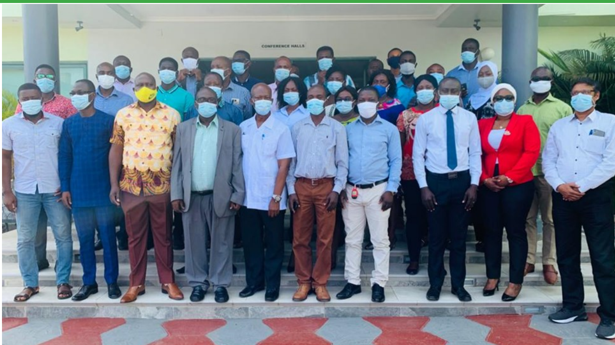
Trainers and Participants

The Public Procurement Authority (PPA) recognizes the critical role the Private Sector plays in the Public Procurement System. As part of its mandate to build the capacity of all stakeholders involved at all levels of the Public Procurement System, the Authority organized a training workshop for suppliers on the preparation of the Revised Standard Tender Documents. The workshop took place at the Crystal Palm Hotels on Tuesday, 6th October, 2020.