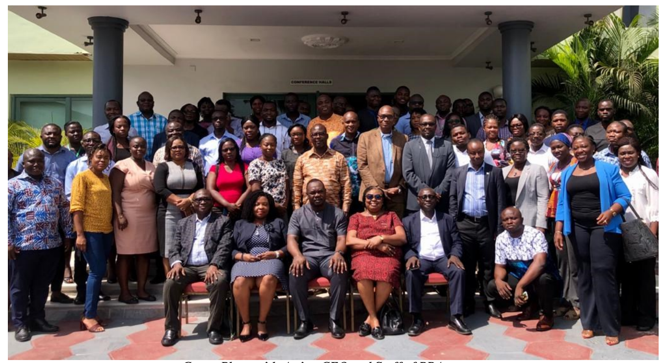
Group Photo with Acting CEO and Staff of PPA

There were also participants from the Western, Volta, Northern and Ashanti Region.