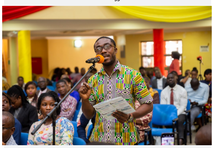
A student of Accra Technical University