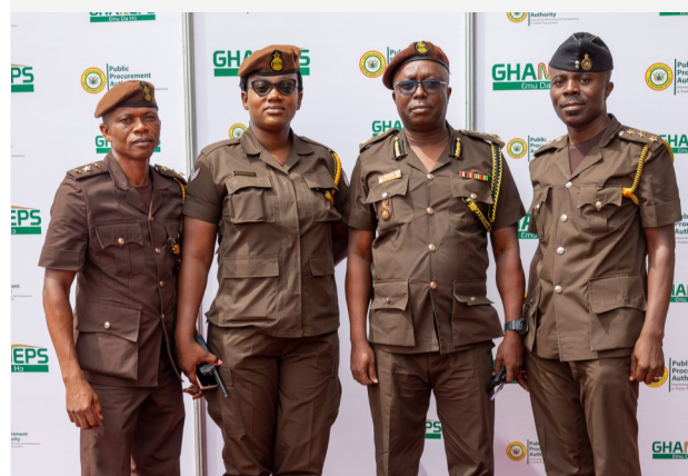
Arrival of Guests