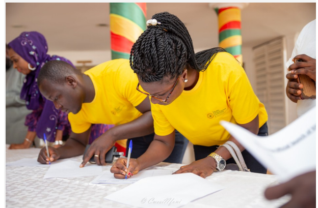
Registration of Participants