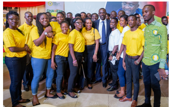
Students of Koforidua Technical University (KTU)