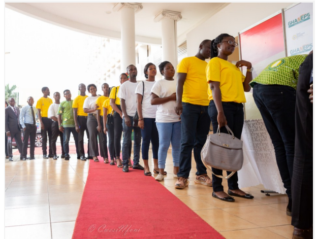
Arrival of Guests