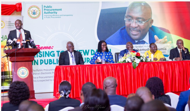
High Table—Deputy Board Chair, Minister of Communications, Vice President, CEO of PPA and Country Director of the World Bank