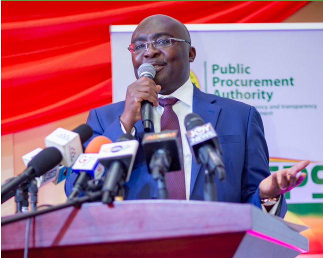
Keynote Address delivered by the Vice President Dr. Mahamudu Bawumia