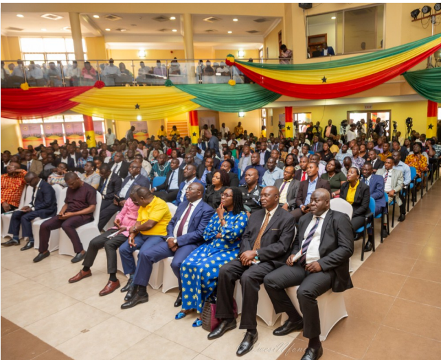
Guest seated in the Auditorium