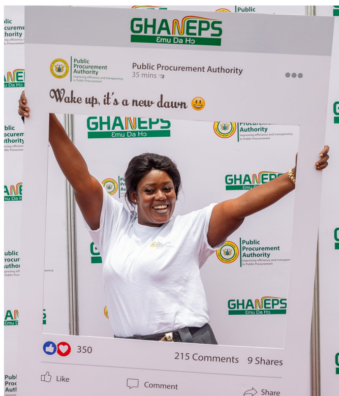
GHANEPS social media stand