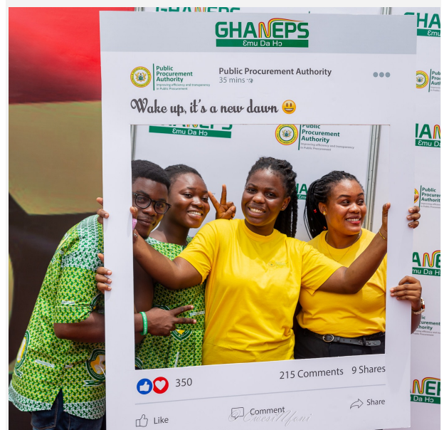
GHANEPS social media stand