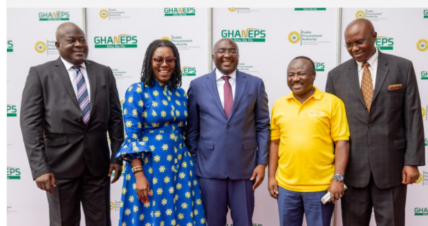
Deputy Board Chairman, Minister of Communications, Vice President, CEO of Public Procurement Authority and Country Director of the World Bank arriving for the official launch of the EGP