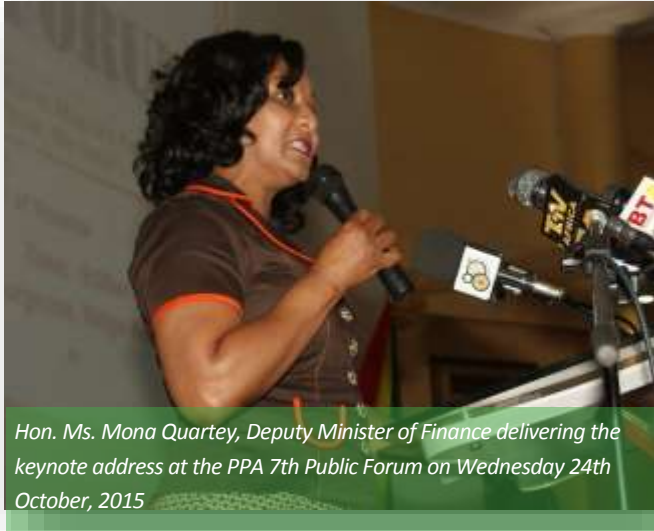
Hon. Ms. Mona Quartey, Deputy Minister of Finance delivering the keynote address at the PPA 7th Public Forum on Wednesday 24th October, 2015

KEY NOTE ADDRESS BY THE HON. MINISTER OF FINANCE AT THE 7 TH PUBLIC FORUM OF THE PUBLIC PROCUREMENT AUTHORITY-WEDNESDAY, 28 TH OCTOBER, 2015 @ THE COLLEGE OF PHYSICIANS AND SURGEONS