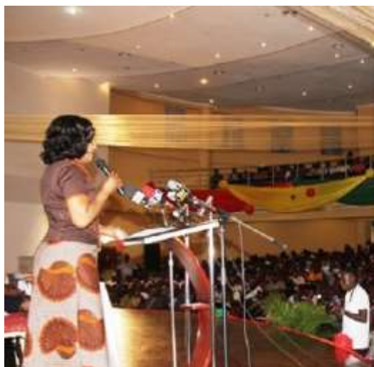
Hon. Ms. Mona Quartey, Deputy Minister of Finance delivering the keynote address at the PPA 7th Public Forum on Wednesday 24th October, 2015